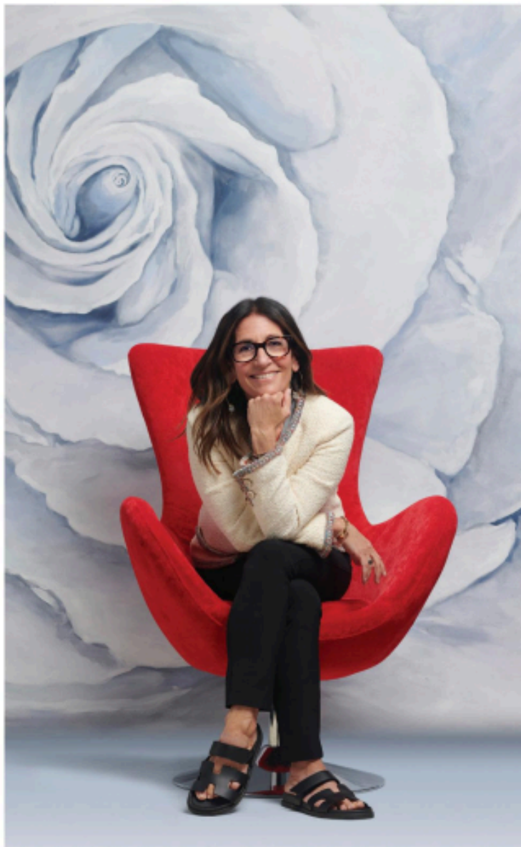
East Hampton Emergency Department Luncheon guest speaker, beauty icon Bobbi Brown.