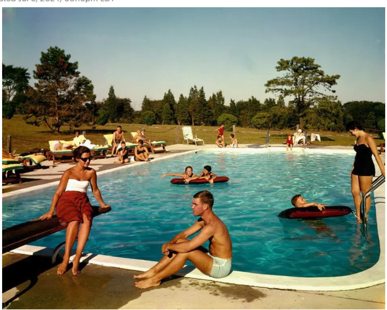
People swim in (and lounge around) the outdoor swimming pool at the Tocker Mill Inn, Southampton, ... [+]

Let's face it—the summer's hottest parties are in the Hamptons. With celebrities, nature, sprawling venues and the beach, all of the East End fundraisers and cocktail parties are in full swing.